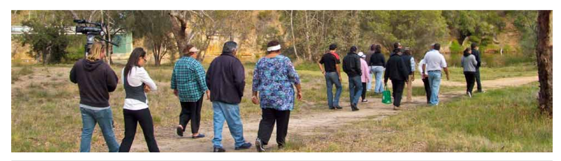
1. Janke, T. and Quiggan, R. Background Paper 12: Indigenous Cultural and Intellectual Property and Customary Law. Law Reform Commission of Western Australia. http://www.lrc. justice.wa.gov.au/ 2publications/reports/ACL/BP/BP-12.pdf (accessed 2 December 2010).

Demonstrating that Noongar concerns, suggestions and ideas have been taken into consideration is critical to building an enduring and respectful relationship. Meaningful engagement also involves continual involvement of the Noongar community in processes and timelines. Noongars should share in any economic opportunities from the project and be able to take advantage of any future opportunities for participation.